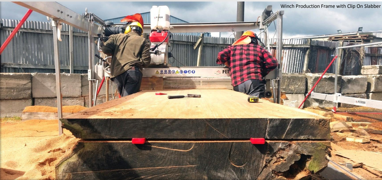
Winch Production Frame with Clip On Slabber