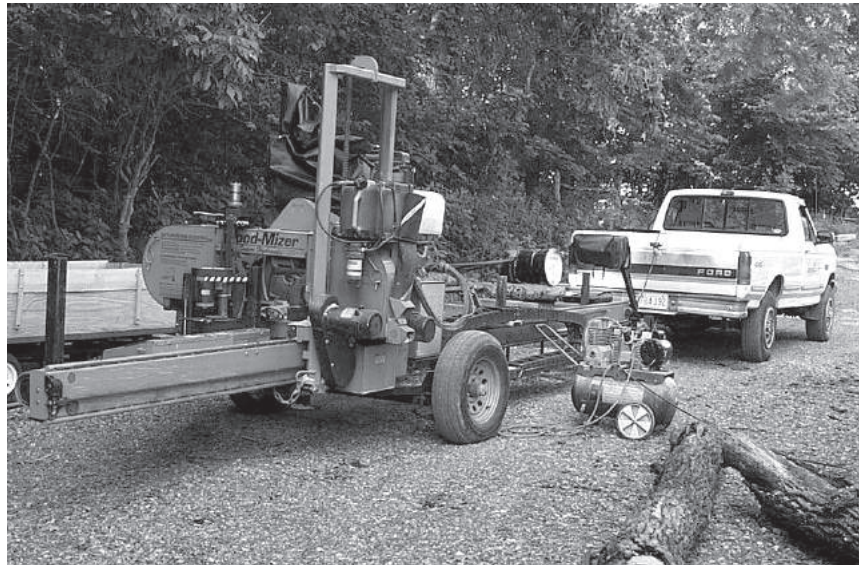
When you buy a mill, you'll have to decide whether to get the trailer package. The ability to bring the mill to the site is a major appeal to many customers.

Some manufacturers sell their mills as stationary units without the trailer package for buyers who are not interested in a portable feature. Are you going to custom-saw at a base site or be a portable operation going to various sites? This decision will influence whether or not you'll need the trailer package. These mills pull very easily and can be set up quickly on reasonably level ground. The ability to bring the mill to the site is a major appeal to most customers. The