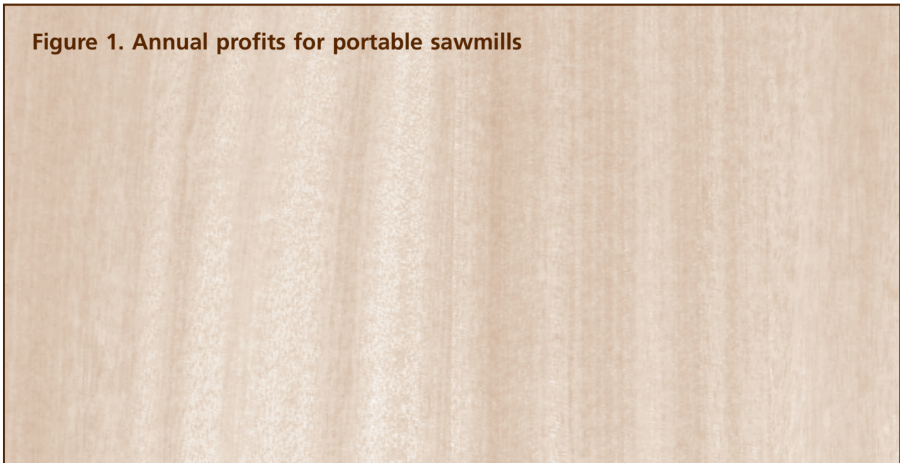
Figure 1. Annual profits for portable sawmills

Based on these results, it appears that a prospective owner-operator of a portable sawmill might well consider buying either a small unit with low daily output and a relatively low initial cost, or a fairly large unit that is more mechanized and can produce much more lumber than a small unit. But if the operator of the medium mill didn’t hire an assistant the profit margin would improve substantially (even in consideration of reduced production rate). With the larger unit the operator would most likely require an additional person to help to optimize production