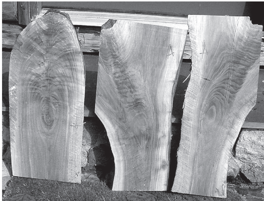
Specialty cuts such as the burl on the left and book-matched black cherry pieces on the right may be cut from a log not useful for traditional dimension lumber.

A bit of sage advice shared by experienced owner-operators is, “Don’t expect to be able to outcompete prices offered by retail lumber dealers.” If you are to stay in business and make a profit, you must be able to offer something that your competition (retailers or other portable sawmill owners) can’t. Find your